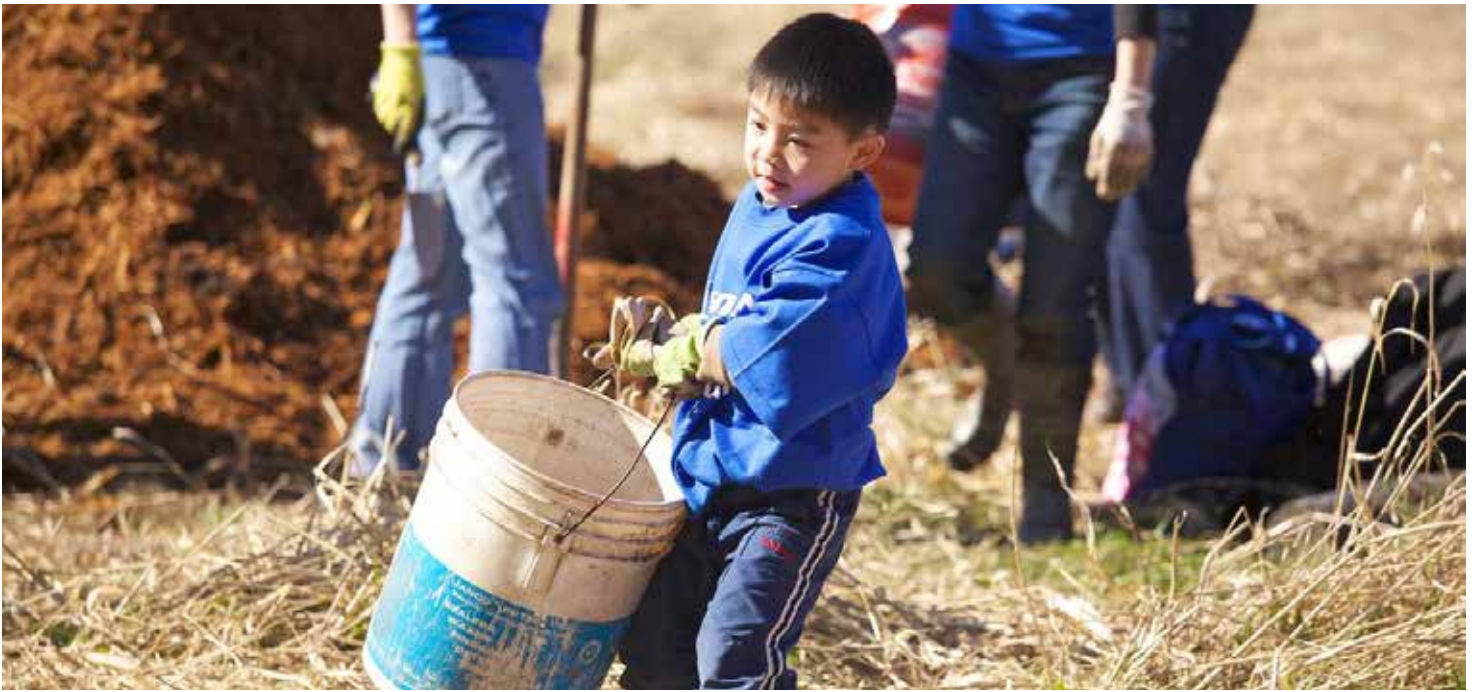
Sanford's Farm work party.