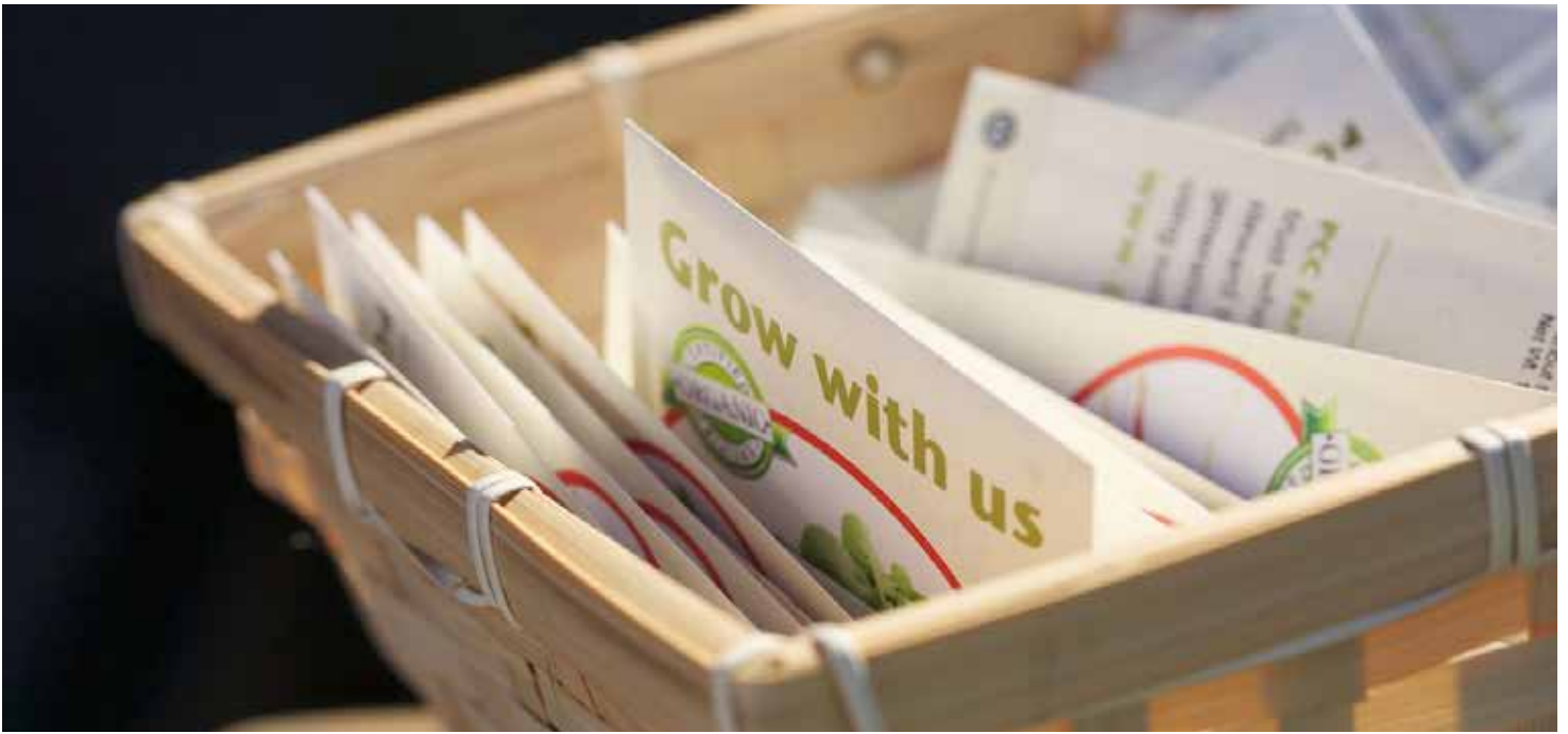
Organic radish seeds.