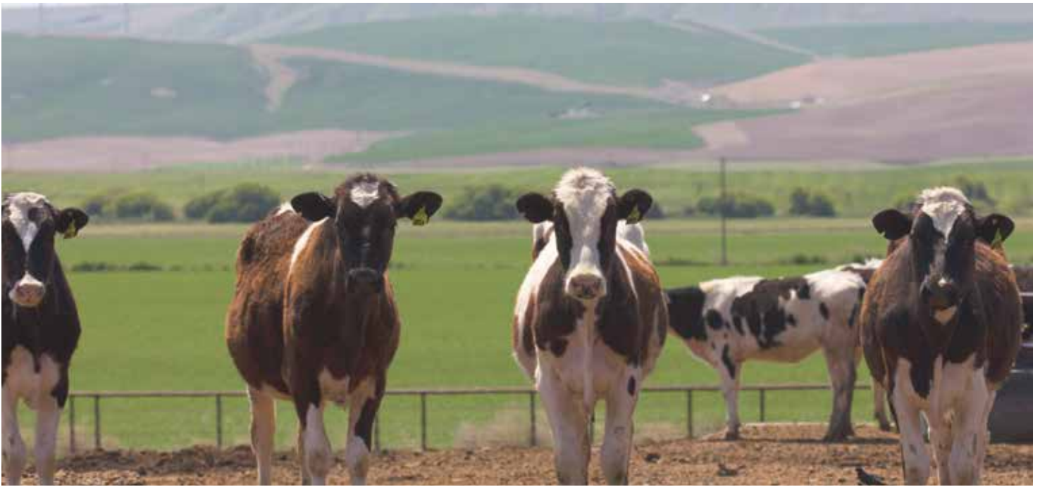
Williams Hudson Bay Farm