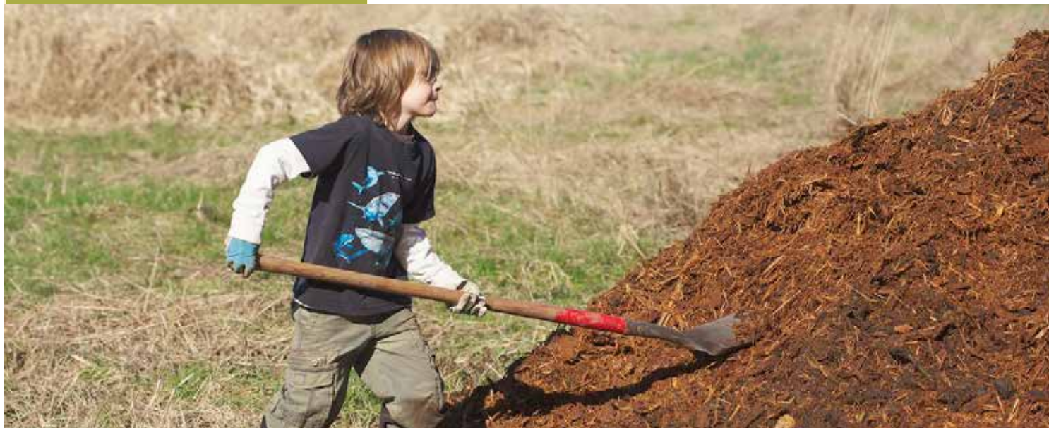
Sanford's Farm work party.